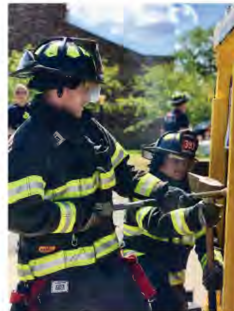
PFD training for forced entry firefighting

Since its inception, the foundation has donated more than $35 million to fire departments across the country for equipment, training and support.