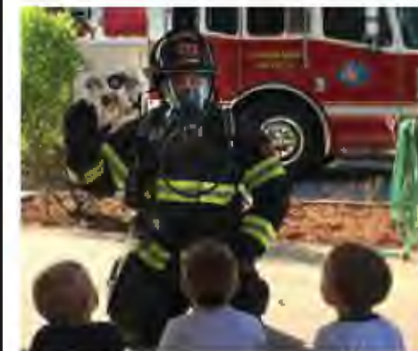
It's never too early to teach fire safety.

We make time each year to visit the nine schools and numerous daycare centers in Fire District 3, educating students on fire prevention and safety. With four new schools in the planning stages, our efforts to reach even more young people will expand in coming years.