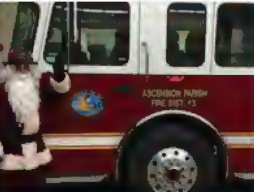
Santa Claus rides with the PFD