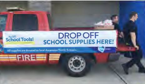
Collecting School Supplies