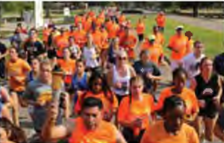
Special Olympics Torch Run