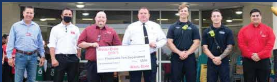
Representatives of Winn Dixie present a check to the PFD to help fund our work. Firehouse Subs also contributes a part of its proceeds to first responding agencies across the country.